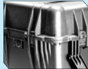
Graduated Deflector Ribs