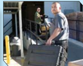
Double Grip Fold-Down Transport Handles