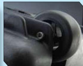
Stainless Steel Ball Bearing Wheels