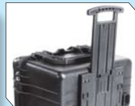
Model 1218 Extendable Transport Handle

FlowStop is a unique inflatable containment pipe plug designed with single and dual 2 inch flow through ports for servicing non-pressurized pipes from 12" to 48". Its purpose is flow control, containment, and remediation of hazardous and contaminated fluids as well as drain line maintenance.