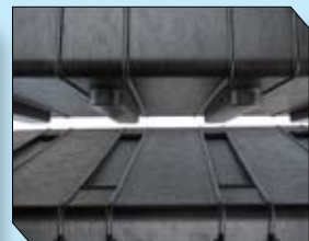
Lock-in Cleats for Stacking Stability